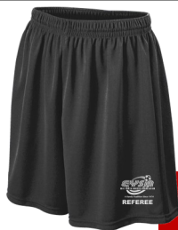
6" Inseam Mesh Shorts