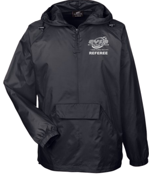
Quarter Zip Hooded Pullover Jacket