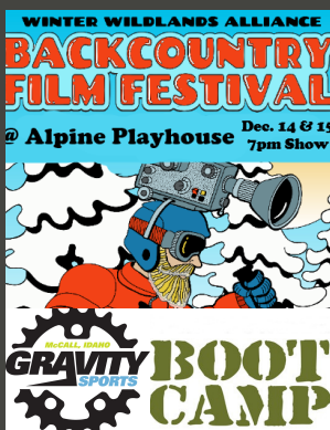
Backcountry film festival A SERIES OF SHORT FILMS

MWSC annually hosts alpine races, big mountain competitions and holiday camps at Little Ski Hill and Brundage Mountain; bringing athletes from all over Idaho, Utah, Wyoming and Oregon to compete in USSA and IFSA sanctioned events - and have fun. Besides on-mountain events, we produce celebrations, fundraisers and social gatherings; including our Christmas Tree Lot in November, Backcountry Film Fest in December, Hometown Races and Chris Bodily Memorial 4-Way Races in January, Hidden Valley Hoedown and 4x4 Brew Pairing Dinner in March, Community Gear Swap in May and Ski Bum Scramble in August.