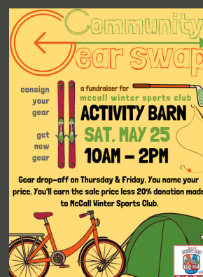
Community Gear swap FUNDRAISER, LIVE MUSIC & GAMES