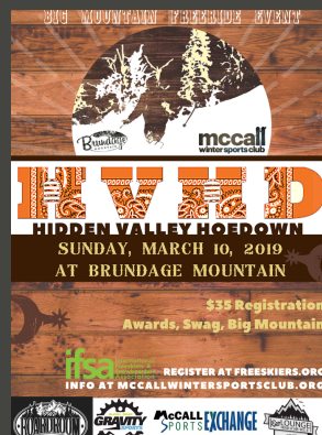
Hidden Valley Hoedown IFSA BIG MOUNTAIN COMP