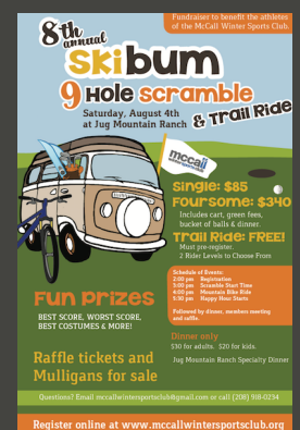
Ski Bum Scramble FUNDRAISER, GOLF & DINNER